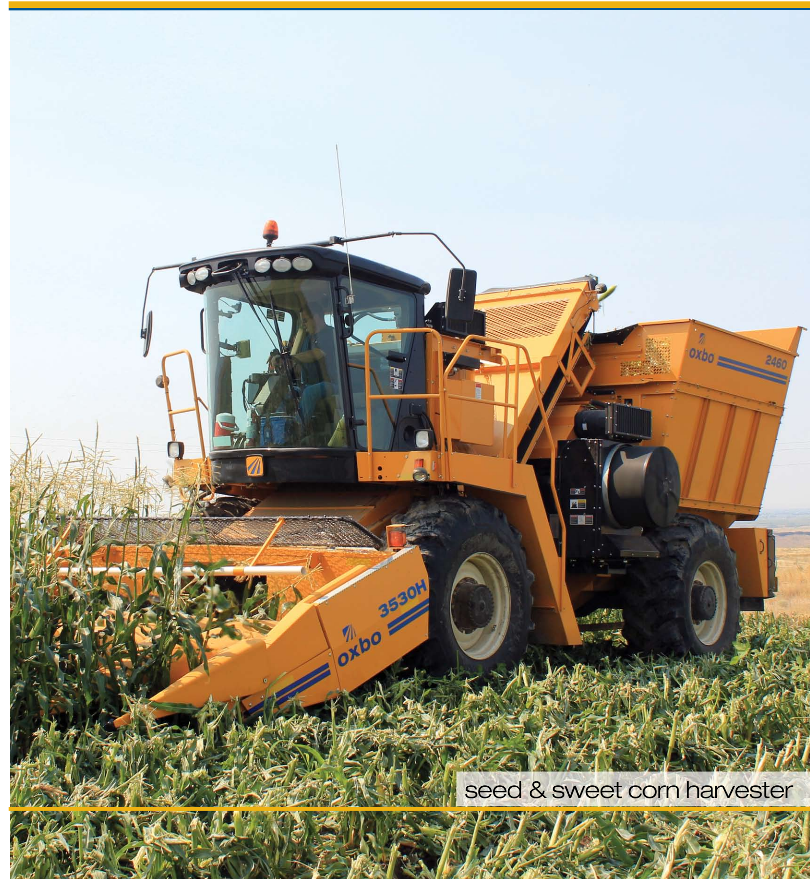
seed & sweet corn harvester