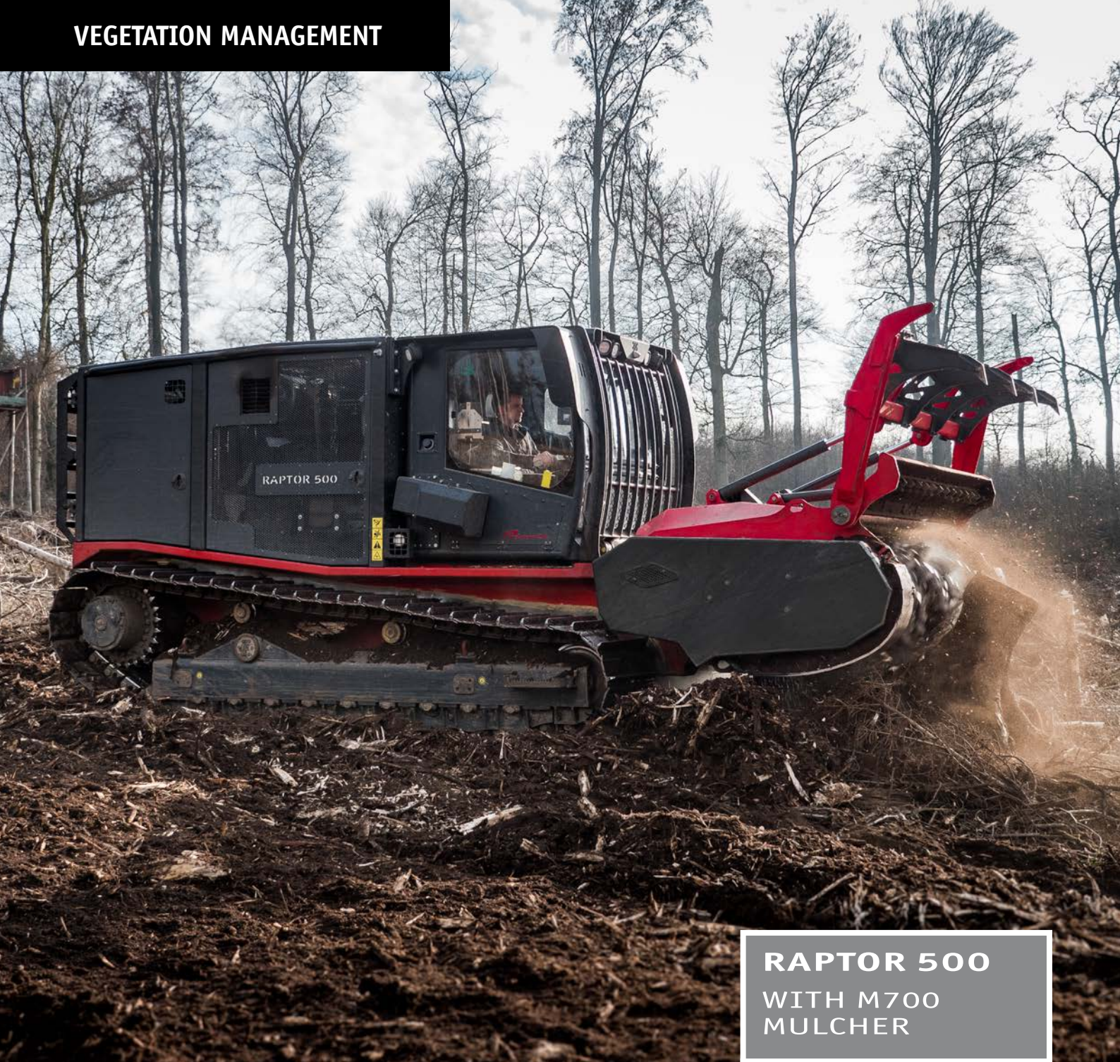
RAPTOR 500 WITH M700 MULCHER